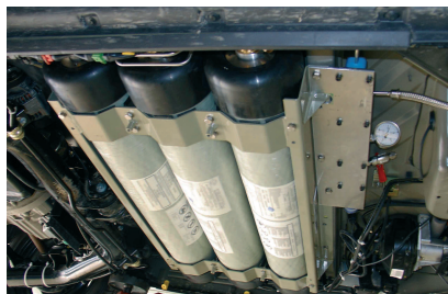
Integration of the tanks under the chassis